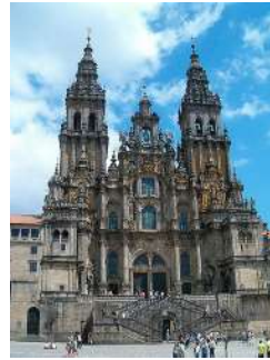
SANTIAGO DE COMPOSTELA, SPAIN

This morning, we will visit the Crypt of St. James , the patron saint of Spain and brother of St. John the Beloved. St. James lived and preached in Spain for a time before he returned to Jerusalem, where he was the first Apostle to be martyred. We will also visit the tombs of St. Athanasius and St. Theodore , the Church of San Francisco , built in honor of St. Francis' pilgrimage to the town around the year 1213, and the churches San Roque and Santa Clara . Dinner and overnight in Santiago de Compostela. [B,D]