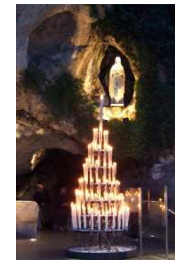
GROTTO OF MASSABIELLE, LOURDES, FRANCE

Today will be spent in Lourdes celebrating the birthday of our Blessed Mother and her spiritual relationship with young Bernadette Soubirous. Between February 11, 1858 and July 16, 1858, Our Lady appeared 18 times to a 14-year-old girl named Bernadette Soubirous. The young saint describes Our Lady as a lady "in white, the same height as myself, who greeted me with a nod of her head. This [lady] was beautiful beyond description. She had a blue sash around her white dress and yellow roses on her shoes. A long rosary hung from her arm, and she seemed to invite me to pray with her." Our Lady gave Bernadette secret messages for herself and other messages for the world to hear. She described herself as the Immaculate Conception, she revealed a miraculous spring and she asked that a chapel be built for pilgrimage. During our stay in Lourdes, we will celebrate Mass at the Grotto of Massabielle (subject to confirmation). We'll visit the Basilica of the Immaculate Conception, the Boly Mill where St. Bernadette was born and the "Cachot," an abandoned prison where Bernadette's family lived in poverty. We'll have an opportunity to participate in the "water gesture" at the Grotto, attend the Blessing of the Sick, and have time for personal prayer. Time permitting, there will be free time to explore independently. Suggestions include: