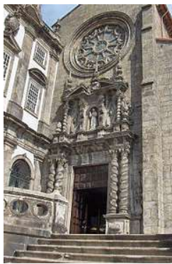
CHURCH OF ST FRANCIS, PORTO

Porto is our first stop today. We enjoy a beautiful scenic tour of the coastal city. We visit the Old Quarter and the Igreja de São Francisco (Church of Saint Francis) which is the most important Gothic monument in the city. Porto is home of one of the country's most internationally known products, its Port wine which bears the city's name because the product was originally shipped from the area. We continue our journey north to Santiago de Compostela , where we will check into our hotel for dinner and an overnight. [B,D]