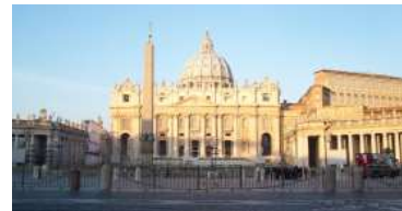
BASILICA OF ST PETER

Our day begins at the Vatican Museum and Sistine Chapel , where Michelangelo's restored masterpieces adorn the ceilings and walls. From there we enjoy a guided tour of St. Peter's Basilica . The Basilica