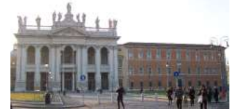
▲ BASILICA OF ST JOHN LATERAN ▼ BASILICA OF ST MARY MAJOR

This morning we begin at the Basilica of St John's Lateran , the Cathedral church of the Pope, is our first stop today. This church was originally built by Constantine when he ended the Christian persecutions. Here we see the Altar that holds the relics of Sts. Peter and Paul. Next to the Basilica is the Baptistery and across the street we visit the Sancta Scala - Holy Stairs , which were transported