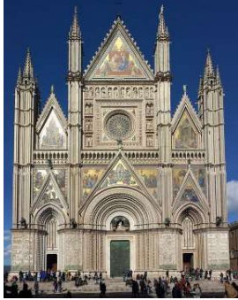
CATHEDRAL OF ORVIETO