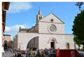
BASILICA OF ST CLARE

Exploring Assisi today will include being escorted by cars to the church of