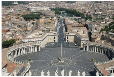
ST PETER'S SQUARE

This evening, join friends or enjoy a private sampling of authentic Roman cuisine at the restaurant or trattoria (local diner) of your choice as dinner is on your own . Overnight in Rome. [B]