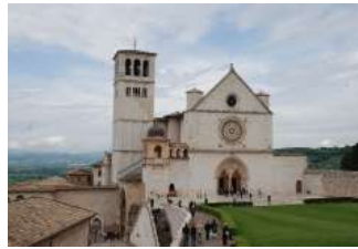
BASILICA OF ST FRANCIS

been speaking of His living Church. Next, we visit one of Christianity's most revered shrines, the Basilica of St. Francis , and see the frescoes depicting events in the life of this gentle saint. There will be free time to explore independently. Suggestions include: