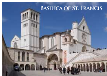
BASILICA OF ST. FRANCIS

Our day begins at the Shrine of Rivotorto . We visit with one of the monks from the monastery and have time to pray . Then, we proceed to the lower plains of Assisi to explore the Basilica of St. Mary of the Angels , built in 1569 to protect the Portiuncula. The Portiuncula is the church that St Francis and his brothers were given shortly after Pope Innocent III approved of their rule. We also see the statue of St Francis with the live white doves, the thorn-less rose bush and the cave where St Francis prayed in solitude. Next, we enjoy a guided visit of the upper and lower level of the Basilica of St Francis , one of Christianity's most revered shrines and where frescoes depict events in the life of this gentle saint. We check in at our hotel in Assisi for dinner and overnight. [B,D]