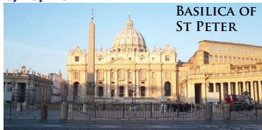
BASILICA OF ST PETER

Our first stop today is at the Vatican Museum and the Sistine Chapel where Michelangelo's restored masterpieces adorn the ceilings and walls. We enjoy a guided tour and then proceed to the Basilica of St. Peter . Inside the basilica, we view one of Rome's most recognized works of art, Michelangelo's Pieta and we visit the tombs of our newest saints, Pope St. John Paul II and Pope St. John XXIII. From there, There will be free time to explore on your own.