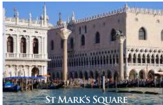
ST MARK'S SQUARE

Upon our arrival in Venice, we have an orientation tour of the charming city. Venice is built on 118 tiny islands, criss-crossed by 160 canals, and linked by 400 footbridges. We make our way to the Church of San Marco where we have time to pray and browse St. Mark's Square . We proceed to Venice to check in at our hotel for a welcome dinner and overnight. [D]