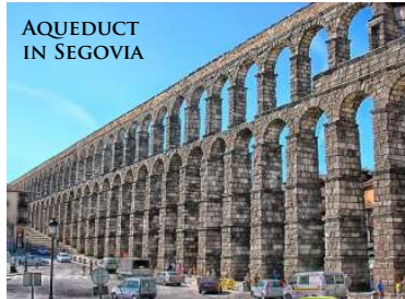
AQUEDUCT IN SEGOVIA

This morning we visit the Monastery of the Incarnation and the convent of St. Teresa , where the saint experienced her remarkable vision of the angel. This afternoon we travel to Segovia , where the sacred relic of St John of the Cross is enshrined. St John was the confessor of St Teresa and often conferred with her on their experiences in the spiritual life; he is one of Christianity's foremost authorities on spiritual and mystical theology. We visit the convent near the Vera Cruz church , constructed by the Templars, where the mortal remains of Saint John of the Cross are buried. Inside the city walls we also see the best-conserved aqueduct of the Imperial Roman Empire. In addition to viewing this 2000-year-old engineering marvel, we visit Alcazar castle , the last in the Spanish gothic style to be constructed. We enter the famous castle, which was an inspiration for Walt Disney when he created his Cinderella castle. We continue on to Burgos for dinner and overnight. [B,D]