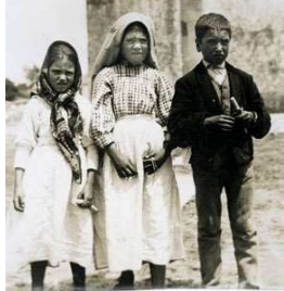
THE SHEPHERD CHILDREN

In 1917, in the village of Fatima Our Lady appeared to three shepherd children; Lucia dos Santos (10) and her cousins Francisco and Jacinta Marto (9 and 7). Each month on the 13th from May until October of that year, Our Lady appeared to the children with specific prayer requests. She told the children, "I have come to warn the faithful to amend their lives and to ask pardon for their sins.