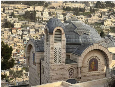
ST PETER OF GALLICANTU