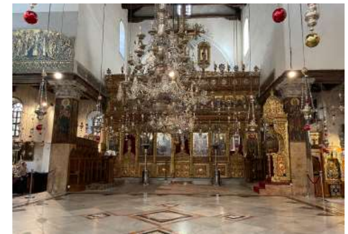
INSIDE CHURCH OF THE NATIVITY

This morning, we drive to the Mount of Olives for a panoramic view of Jerusalem. We visit the Church of Pater Noster and the Chapel of Ascension and then we walk down the hill to Dominus Flevit Chapel , where Jesus wept over Jerusalem. We proceed to the Garden of Gethsemane to visit the cave of betrayal and the Church of All Nations where Jesus endured his Agony. We continue to Bethlehem to visit the Church of the Nativity, the Manger, the Crusader's Cloister and the Grotto of St. Jerome . We then visit the cave in Shepherd's Field and view the Fields of Boaz . We will stop for shopping in Bethlehem and return to the hotel for dinner and overnight. [B,D]