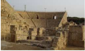
AMPHITHEATRE / CAESAREA MARITIME

Upon arrival in Tel Aviv, we meet our full-time tour escort and board our motor coach and head north along the Israeli coast, parallel to the Mediterranean Sea. Our first stop is Caesarea Maritime , where we view the Roman aqueduct and port, Crusader's Moat and the ruins of the ancient amphitheater located on the shore of the Mediterranean. It was in Caesarea that Paul was imprisoned, tried, and sent from this Mediterranean harbor to Rome. Next, we continue north to Haifa and stop at the Stella Maris, Our Lady of Mount Carmel and the home of the prophet, Elijah. From there, we drive to the top of Tiberias we have a splendid view of the city and the Sea of Galilee. We continue into Tiberias to check in at our hotel for a group welcome dinner. [D]