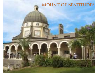
MOUNT OF BEATITUDES

The Mount of Beatitudes is a beautiful, peaceful place well suited for contemplative reflection and prayer. It is here that we begin today's journey. Then, we proceed to Capernaum , where Peter lived and within which Jesus made his base of operations for His Galilean ministry. As we visit the ruins of the town you will find out why Jesus focused his ministry here, where ancient Judaism flourished. We visit the Synagogue where Jesus healed and taught and also visit the church that was built over the ruins of Peter's house . Tabgha , location of the miracle of the loaves and fishes and the nearby Church of St. Peter's Primacy are our next stops before we enjoy a relaxing boat ride on the lovely Sea of Galilee . Time permitting, we visit the ancient boat at Kibbutz Nof Ginosar , which was dated back to the time of Christ. Our day concludes as we return to our hotel for dinner and overnight. [B,D]