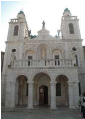
THE CHURCH IN CANA

Cana , the place where Jesus performed his first miracle, is our first stop this morning. Couples may renew their wedding vows at the place where Jesus changed the water into wine at the wedding in Cana. From there, we continue a short distance to Nazareth , where Jesus played, grew up amongst the other children of the city, and later worked with Joseph in carpentry. We visit the Church of the Annunciation , location of the grotto just behind the altar where Mary said "yes" to the angel of the Lord. We visit St. Joseph's carpentry shop, Mary's well, and the Church of St. Joseph in Nazareth . Next, we stop at Mt. Tabor , site of the Transfiguration, located on a hill that rises above the Jezreel Valley. We conclude our day as we return to our hotel for dinner and overnight. [B,D]