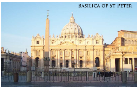
BASILICA OF ST PETER

Indulge in a pizza pie at local trattoria (diner) or enjoy a delicious Italian meal at the restaurant of your choice as dinner is on your own . Overnight in Rome. [B]