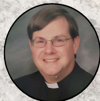
Pastor, St John the Evangelist Rector, St. Francis Xavier Cathedral (Green Bay, WI)