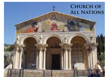
CHURCH OF ALL NATIONS