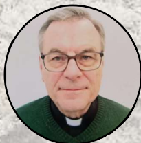
Sacramental Minister, Prince of Peace Parish (Bellevue, WI)

$3,499 + $559* from Chicago Early registration price per person if deposit is paid by 1-14-22