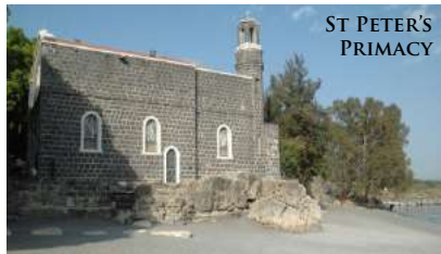
ST PETER'S PRIMACY

Day 4: Wednesday 3/16, TIBERIAS / CAESAREA PHILIPPI / CAPERNAUM / TABGHA / PETER'S PRIMACY / SEA OF GALILEE / TIBERIAS This morning, we venture north to visit Caesarea Philippi, just north of the Sea of Galilee and at the base of Mt. Hermon. Also called "Baniyas", Caesarea Philippi is the location where Jesus declared Peter "Rock" and entrusted him with the keys to the kingdom of Heaven. During our visit, we will see one of the three springs that feeds the Jordan River. On our way back toward Tiberias, we stop in Capernaum. This is the town where Peter lived and within which Jesus made his base of operations for His Galilean ministry. As we visit the ruins of the town you will find out why Jesus focused his ministry here, where ancient Judaism flourished. We will visit the Synagogue where Jesus healed and taught, and also Peter's house. Nearby, we stop at Tabgha, location of the miracle of the loaves and fish and the Church of St. Peter's Primacy, where Jesus appeared after the Resurrection. We visit there before spending time on the Sea of Galilee on a relaxing boat ride. We return to our hotel for dinner and an overnight. [B,D]