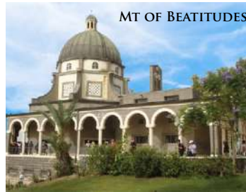
MT OF BEATTITUDES

other children of the city, and later worked with Joseph in carpentry. It is here in the Church of the Annunciation just behind the altar where you can see the grotto where Mary said "yes" to the angel of the Lord. Next, we visit St. Joseph's carpentry shop, Mary's Well, and the Church of St. Joseph. The Mount of Beatitudes, site of Jesus' Sermon on the Mount is the perfect end to our day. We relax in tranquil and contemplative time before we return to our hotel for dinner. Overnight in Tiberias. [B,D]