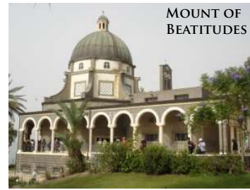
MOUNT OF BEATITUDES