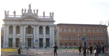
ST JOHN LATERAN ▲ ST MARY MAJOR ▼

Today we proceed to the Cathedral church of the pope, St. John Lateran . Constantine built the original church on this site when he ended the Christian persecutions. Here we see the Altar that holds the relics of Sts. Peter and Paul. Next to the Basilica is the Baptistry and across the street visit la Sancta Scala (Holy Stairs), which were transported from Pilate's palace in Jerusalem and on which the Savior climbed before His crucifixion. Those who wish to pray each step on their knees may do so. The option to take the side stairs on foot is also available. We visit the Basilica of St. Mary Major . Inside the Basilica we view relics of Jesus' manger from Bethlehem. This afternoon, we proceed to the beautiful Basilica of St. Paul Outside the Walls which houses the remains of St. Paul under the main altar. We also visit the Catacombs before we enjoy a group farewell dinner at Ristorante la Carovana . Overnight in Rome. [B,D]