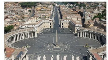
ST PETER'S SQUARE

Today we proceed to the Cathedral church of the pope, St. John Lateran . Constantine built the original church on this site when he ended the Christian persecutions. Here we see the Altar that holds the relics of Sts. Peter and Paul. Next to the Basilica is the Baptistery and across the street visit la Sancta Scala (Holy Stairs), which were transported from Pilate's palace in Jerusalem and on which the Savior climbed before His crucifixion. Those who wish to pray each step on their knees may do so. The option to take the side stairs on foot is also available. Then, we proceed to St. Peter's Square for prayers and a greeting by our Holy Father, Pope Francis (provided Our Holy Father is home). This afternoon, we proceed to the beautiful Basilica of St. Paul Outside the Walls which houses the remains of St. Paul under the main altar. We also visit the Catacombs before we return to our hotel for dinner and overnight. [B,D]