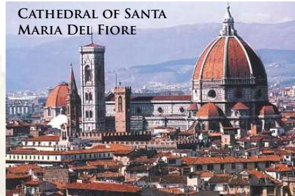
CATHEDRAL OF SANTA MARIA DEL FIORE

We depart Venice this morning and proceed to beautiful Florence. We enjoy a panoramic view from the Piazza Michelangelo . Then, we proceed to visit the Cathedral of Santa Maria del Fiore and view the Baptistery and Campanile (bell tower) . The Cathedral is the fourth largest church in Europe and the tallest building in present day Florence. Especially notable are the Baptistery's gilded bronze doors, which were done by Ghiberti in 1401. Next, we stop at the Accademia to see the original statue of "David". Our final stop today is at the historical and present day center of Florentine activity, the Palazzo Vecchio ("old palace") and the Piazza della Signoria . The Piazza is a popular area for people to stroll and gather; in the past it has served as a place of public meeting and even execution. Our day concludes as we check in at our hotel for dinner and overnight. [B,D]