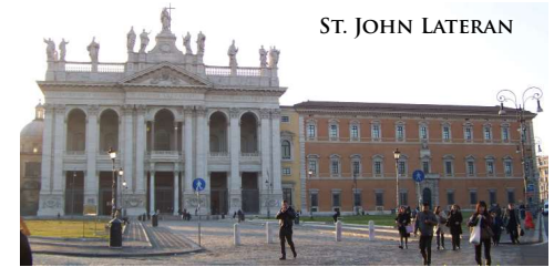
ST. JOHN LATERAN