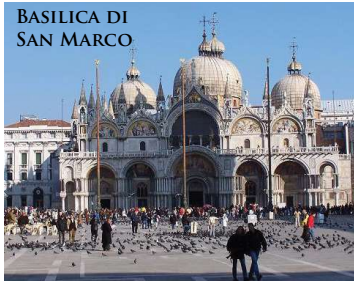
BASILICA DI SAN MARCO

Upon our arrival in Venice, we have an orientation tour of the charming city. Venice is built on 118 tiny islands, criss-crossed by 160 canals, and linked by 400 foot-bridges. We will tour the Basilica di San Marco . We proceed to our hotel for check in for a welcome dinner and overnight. [D]