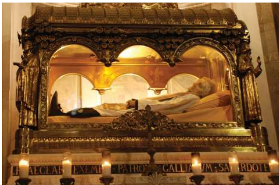
THE INCORRUPT CURE OF ARS, ST. JOHN VIANNEY

This morning we begin at the Convent of St Gildard , where St Bernadette spent the last 13 years of her life. It is here that we have the opportunity to view her incorrupt body. As you look at St Bernadette you see the same fingers that dug in the earth at Massabielle in Lourdes and the same eyes that saw the Virgin Mary. Next, we visit Paray-le-Monial . This is the site of the apparitions of our Lord to St Margaret Mary Alacoque in 1673. It is here that she received the inspiration to increase devotion of the Sacred Heart of Jesus. We visit the Chapel of the Apparitions . Time permitting, we also visit the church of St Claude la Colombiere, the spiritual director of St Margaret Mary. We continue to the small town of Ars , to see the incorrupt St John Vianney, patron of parish priests. We visit the Basilica of Ars , the former home of the Curé, the underground church, and the St John Vianney Wax Museum . We also have the opportunity to receive the Sacrament of Reconciliation in the confessional where he spent 17 hours a day for over 30 years. Today's journey concludes as we make our way to Lyon to check in for dinner and overnight. [B,D]