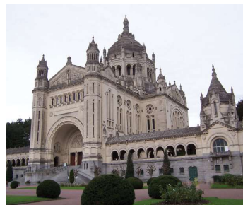
BASILICA OF ST. THERESE, LISIEUX

Early this morning, we proceed to the train station for our travel to Paris by rail. Upon arrival, we board our motor coach and catch glimpses of the city as we continue to Rouen to visit the modern church of St Joan of Arc , built on the site where the British burned her at the stake for "heresy." We will also visit the Cathedral , a masterpiece of Gothic architecture. From there, we proceed to Lisieux , the home of St Therese of the Child Jesus. She is the one whom Pope Pius X called "the greatest saint of modern times. Today's journey concludes with a visit to Les Buissonnets , the family home where Therese spent the early years of her life before entering Carmel at the age of fifteen. We check in at our hotel for dinner and overnight. [B,D]