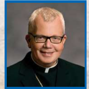
(Bishop of Madison, WI)

invites you on an 11-day pilgrimage to explore Annecy, Ars, Bayeux Lisieux, Lourdes, Nevers, Normandy, Paris, and Rouen