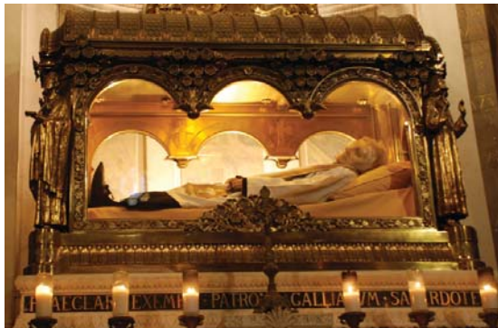
THE INCORRUPT CURE OF ARS, ST. JOHN VIANNY

This morning we begin at the Convent of St Gildard , where St. Bernadette spent the last 13 years of her life. It is here that we have the opportunity to view her incorrupt body. As you look at St. Bernadette you see the same fingers that dug in the earth at Massabielle in Lourdes and the same eyes that saw the Virgin Mary. Next, we visit Paray-le-Monial . This is the site of the apparitions of our Lord to St. Margaret Mary Alacoque in 1673. It is here that she received the inspiration to increase devotion of the Sacred Heart of Jesus. We visit the Chapel of the Apparitions . Time permitting, we also visit the church of St. Claude la Colombiere, the spiritual director of St. Margaret Mary. We continue to the small town of Ars, to see the incorrupt St. John Vianney , patron of parish priests. We visit the Basilica of Ars , the former home of the Curé, the underground church , and the St. John Vianney Wax Museum . We also have the opportunity to receive the Sacrament of Reconciliation in the confessional where he spent 17 hours a day for over 30 years. Today's journey concludes as we make our way to Lyon to check in for dinner and overnight. [B,D]