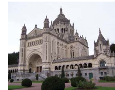
BASILICA OF ST. THERESE, LISIEUX

We begin today at the beautiful Basilica of Lisieux and then the Carmelite Convent which houses the sacred relic of St Therese's body. Then, we travel west to Bayeux and Normandy for the day. The impeccably-preserved medieval town of Bayeux is home to a magnificent cathedral and world-famous tapestry . The cathedral , was consecrated in 1077 and soars noticeably above the town. We visit there and see how the structure dabbles both in the Norman and Romanesque styles. The crypt has been unaltered since the 11th century. And, of course a trip to Bayeux wouldn't be complete without seeing the tapestry that chronicles the events leading up to the Norman invasion of England in 1066. Our journey continues as we spend time in Normandy at the Military Cemetery at Omaha Beach and the Museum of the D' Day Invasion . We return to Lisieux for dinner and overnight. [B,D]