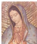
OUR LADY OF GUADALUPE