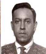
BLESSED MIGUEL PRO