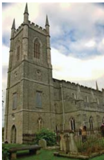
DOWNPATRICK- DOWN CATHEDRAL