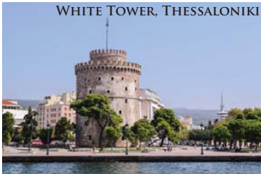
WHITE TOWER, THESSALONIKI

This morning we have free time to explore on our own or shop in Thessaloniki. Suggestions include: a visit to either of the main squares located on the waterfront: Platia Elefterias or Platia