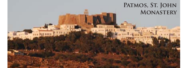
PATMOS, ST. JOHN MONASTERY

the world. St. Paul's descriptive Letter to the Ephesians (5:21-33) describes the sacred bond between Christ and the Church in a beautiful comparison to that of the bond shared by a husband and his wife. During his three years of residency in Ephesus, Paul meets 12 believers. He baptized them in God's holy name and they received the Holy Spirit. Next, we walk back to the motor coach along the Arcadian Way, where Mark Anthony and Cleopatra once rode in procession. From there, we sail to Patmos.