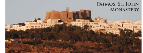
PATMOS, ST. JOHN MONASTERY

the world. St. Paul's descriptive Letter to the Ephesians (5:21-33) describes the sacred bond between Christ and the Church in a beautiful comparison to that of the bond shared by a husband and his wife. During his three years of residency in Ephesus, Paul meets 12 believers. He baptized them in God's holy name and they received the Holy Spirit. Next, we walk back to the motor coach along the Arcadian Way, where Mark Anthony and Cleopatra once rode in procession. From there, we sail to Patmos.