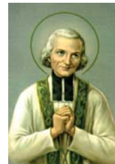
CURÉ OF ARS