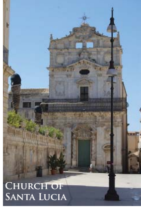
CHURCH OF SANTA LUCIA

Our day begins with a walking tour of downtown Catania . Then, we travel an hour south to Syracuse (Siracusa) to visit the city's historical center, the island of Ortigia, which is detached from the mainland of Syracuse by a narrow strip of sea water and bridged by Ponte Nuovo. In Ortigia, we enjoy a walking tour to see the fountain of Arethusa and Piazza del Duomo . The square is home to the Cathedral which was built on the site of an ancient Temple of Athena. Also on this square is the Baroque Palazzo Benvenuto