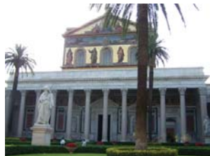
ST. PAUL OUTSIDE THE WALLS

Our day begins early as we enjoy a guided tour of the Basilica of St. Peter , where we view one of Rome's most recognized works of art, Michelangelo's "Pietà" and spend some time absorbing the overwhelming size and beauty of the basilica. Then our local guide will take us to St. Paul Outside the Walls , a beautiful basilica which houses the remains of St. Paul under the main altar. The remainder of the day is free to explore independently. Suggestions include: