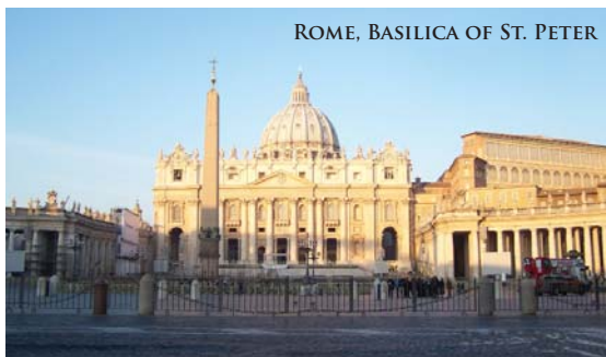
ROME, BASILICA OF ST. PETER

Benedetto is still active today. There is a second monastery, built by Benedetto in Subiaco, named after his twin sister Santa Scolastica. Then, we proceed to Rome to check in at our hotel for dinner and overnight. [B,D]