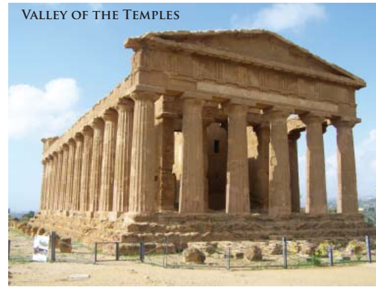
VALLEY OF THE TEMPLES

We depart Catania and proceed to the centrally-located city of Piazza Armerina to visit Sicily's highest point, the Baroque-styled 17th-century cathedral . Then, we have a guided visit at Villa Romana del Casale to see very realistic early 4th-century mosaics. We enjoy lunch on our own. Next, we proceed from Piazza Armerina to Agrigento , a southern coastal city on the Mediterranean. We check in at our hotel for dinner and overnight. [B,D]