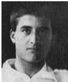
BLESSED PIER GIORGIO FRASSATI

academic centers, laboratories and recreation homes in Italy and abroad. St John Bosco is known as the patron saint of apprentices, boys, editors, Mexican youth, laborers, schoolchildren, and young people in general. Next, we visit Piazza San Carlo, Po Street, and Mount of the Capuchin Monks . From there, we return to our hotel in Milan for dinner and overnight. [B,D]