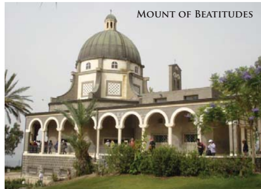
MOUNT OF BEATITUDES

The Mount of Beatitudes is a beautiful, peaceful place well suited for contemplative reflection and prayer. It is here that we begin today's journey. Then, we proceed to Capernaum , where Peter lived and within which Jesus made his base of operations for His Galilean ministry. As we visit the ruins of the town you will find out why Jesus focused his ministry here, where ancient Judaism flourished. We visit the Synagogue where Jesus healed and taught and also visit the church that was built over the ruins of Peter's house. Tabgha, location of the miracle of the loaves and fishes and the nearby Church of St. Peter's Primacy are our next stops before we enjoy a relaxing boat ride on the lovely Sea of Galilee . Time permitting , we visit the ancient boat at Kibbutz Nof Ginosar , which was dated back to the time of Christ. Our day concludes as we return to our hotel for dinner and overnight. [B,D]