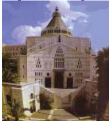
CHURCH OF THE ANNUNCIATION

Cana , the place where Jesus performed his first sign, is our first stop this morning. Couples may renew their wedding vows at the place where Jesus changed the water into wine at the wedding in Cana. From there, we continue a short distance to Nazareth , where Jesus played, grew up amongst the other children of the city, and later worked with Joseph in carpentry. We visit the Church of the Annunciation ,