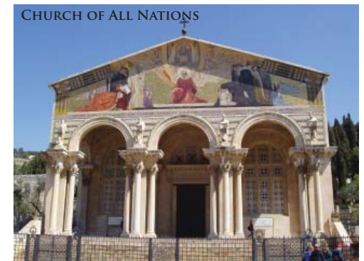
CHURCH OF ALL NATIONS

This morning, we drive to the Mount of Olives for a panoramic view of Jerusalem. We visit the Church of Pater Noster and the Chapel of Ascension and then we walk down the hill to Dominus Flevit Chapel , where Jesus wept over Jerusalem. We proceed to the Garden of Gethsemane to visit the cave of betrayal and the Church of All Nations where Jesus endured his Agony. We continue to Bethlehem to visit the Church of the Nativity, the Manger, the Crusader's Cloister and the Grotto of St. Jerome . We then visit the cave in Shepherd's Field and view the Fields of Boaz. We will stop for shopping in Bethlehem and return to the hotel for dinner and overnight. [B,D]