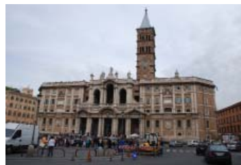
ST. MARY MAJOR

on which the Savior climbed before His crucifixion. Those who wish to pray each step on their knees may do so. The option to take the side stairs on foot is also available. Nearby is the Basilica of St. Mary Major , where we see the relics of the wooden manger in which the infant Jesus was laid after his birth. Then, we proceed to the mother church of the religious Society of Jesus, or Jesuit Order. The church, often called " Gesu Church " was founded by St. Ignatius of Loyola. Among the 800 or so churches in Rome, this hidden gem is gaining popularity as a stop for pilgrims. We return to our hotel for dinner and overnight. [B,D]