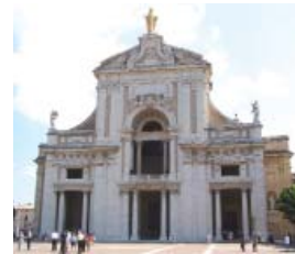
ST. MARY OF THE ANGELS

On our journey out of Assisi, we stop in the lower plains, where we visit the Basilica of St. Mary of the Angels , built in 1569 to protect the Portiuncula (the church that St. Francis and his brothers were given shortly after Pope Innocent III approved of their order.) We also see the statue of St. Francis with the live white doves, the thorn-less rose bushes, and the cave where St. Francis prayed in solitude. We proceed to Rome , stopping to visit St. Paul Outside the Walls , a beautiful basilica which houses the remains of St. Paul under the main altar. Then, we follow the Old Appian Way to the Catacombs . Today's journey concludes as we check in at our hotel for dinner and overnight. [B,D]