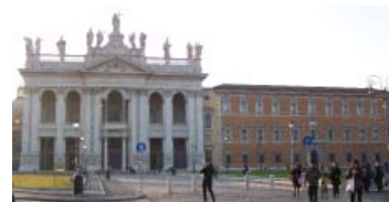
ST. JOHN LATERAN

Today, we visit St. John's Lateran Church , the Cathedral church of the Pope. This church was originally built by Constantine when he ended the Christian persecutions. Here we see the Altar that holds the relics of Sts. Peter and Paul. Next to the Basilica is the Baptistery and across the street visit la Sancta Scalia (Holy Stairs), which were transported from Pilate's palace in Jerusalem and