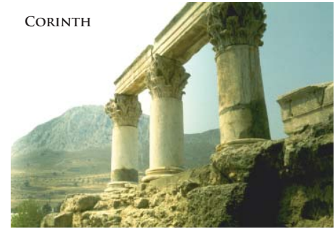
Day 11: Tuesday, October 23, 2018, ATHENS /

Day 10: Monday 10/22, PIRAEUS / CORINTH / ATHENS Today we travel from Athens to the Peloponnesian Peninsula. The Peninsula is connected to the main body of Greece by the Isthmus of Corinth. We cross the Isthmus to the town of the same name , where Paul lived and worked for two years after leaving Athens. The account of the foundation of the Christian Church here by Paul, the Apostle and Patron Saint of Corinth, can be read in Acts 22. We view the excavations, the Bema Seat, and the museum. We return to Athens for a night tour of the city and a sound and light show before continuing to a typical Greek Taverna for dinner. Overnight in Athens. [B,D]