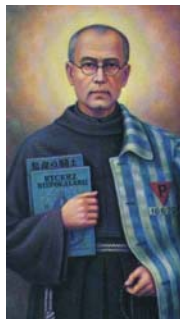
ST MAXIMILIAN KOLBE

faithful and loving children. The portrait has been the subject of numerous miracles and was one of Pope John Paul II's favorite Marian devotions. Today's final destination is Warsaw, where we visit St. Stanislaw Kostka Church (the church of Blessed Fr Jerzy Popieluszko) and museum . Fr Jerzy Popieluszko, a popular young parish priest, spoke out against the abuses of communism and supported the then-banned Solidarity labor union. Thousands flocked to hear his Sunday sermons. He was abducted by the Polish secret police on October 19, 1984, and his savagely beaten body was found eleven days later in an icy reservoir. Father Popieluszko's death serves as testimony to the struggle for freedom, basic rights, and human dignity. We proceed to our hotel to check in for dinner and overnight. [B,D]