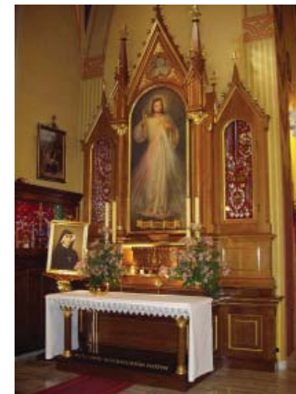
DIVINE MERCY SHRINE

mission, St Faustina died at the convent in Krakow on October 5, 1938. Today her holy relics rest upon the altar in the sanctuary, right under the miraculous image of the Merciful Jesus. We will have a guided tour of the grounds by a Divine Mercy sister and have time for shopping in the sister's gift store . The remainder of the day is free and dinner is on your own . Overnight in Krakow. [B]