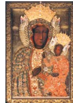
THE BLACK MADONNA

We bid farewell to Krakow and travel to Czestochowa . Upon our arrival, we will visit the Shrine of Our Lady of Czestochowa , one of the most important pilgrimage sites in all of Poland and home to the 600-year old Jasna Gora Monastery. St. Faustina, St. Maximilian Kolbe, and Pope John Paul II came to Czestochowa to offer their lives to God in holy service. Poland's holiest icon, a painting of Our Lady of Czestochowa (frequently called the Black Madonna), is enshrined here. The Black Madonna was brought to this site from Jerusalem in 1384. At certain times of the day a trumpet sounds and Our Lady is revealed to her