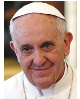
OUR HOLY FATHER POPE FRANCIS

Early today, we proceed to St. Peter's Square for the Papal Audience (provided our Holy Father is home). We listen to the words of His Holiness Pope Francis and receive his blessing with pilgrims from all over the world. After the audience, there will be a photostop by the Colosseum and Roman Forum . From there, we visit the mother church of the religious Society of Jesus, or Jesuit Order. The church, often called "Gesu Church" was founded by St Ignatius of Loyola. Among the 800 or so churches in Rome, this hidden gem is gaining popularity as a stop for pilgrims. We return to our hotel for dinner and overnight. [B,D]