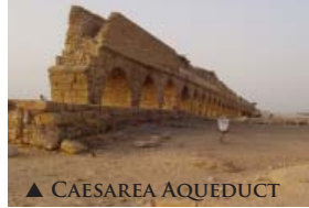
▲ CAESAREA AQUEDUCT

Upon arrival in Tel Aviv we board our motor coach for our first sights of Israel. We visit nearby Jaffa (also called Joppa), the ancient port city where Peter saw a vision that all foods are clean, where the Gentile Mission started, and from where Jonah left prior to being swallowed by the whale. We visit the Church of St. Peter and then proceed to Caesarea , north of Tel Aviv on the Mediterranean to see the Roman aqueduct and port, Crusader's Moat