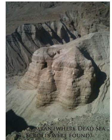
QUMRAN (WHERE DEAD SEA SCROLLS WERE FOUND)

After breakfast, we travel to Bethany , home of Mary and Martha and see the Tomb of Lazarus. From there, we proceed to Jericho , the world's oldest city. Then, we take a cable car to the top of the Mount of Temptations and then up to the Monastery of Temptation . From the tel atop the ruins, we view the lush green Jordan Valley. We proceed to the excavations of Qumran , the Essene