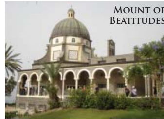
MOUNT OF BEATITUDES

Mount of Beatitudes is the perfect start today as we enjoy some contemplative reflection and prayer. From there, we proceed to Caper-naum , the town where Peter lived and within which Jesus made his base of operations