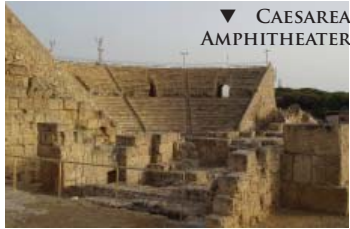
▼ CAESAREA AMPHITHEATER

and the ruins of the ancient amphitheater next to the ocean. It was in Caesarea that Paul was imprisoned, tried, and sent from this Mediterranean harbor to Rome. From there, we continue to Tiberias to check in at our hotel for dinner and overnight. [D]