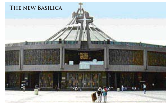
THE NEW BASILICA

We visit the church and see the healing well, which is unknown to most visitors. If possible, we have the opportunity to get water from the healing well which is now dispensed from a faucet in front and to the right of the church altar . Those who visit Santa Maria Tulpetlac are granted a plenary indulgence if they meet the normal requirements of an indulgence. After Mass, we proceed to Cuautitlan , birthplace of St. Juan Diego. From there, we visit Tepeztotlan to see the museum and have a group lunch . After a group lunch at a local restaurant, we proceed to Los Remedios , in the northwest suburb of Mexico City. Our day concludes as we return to our hotel. Dinner is on your own . Overnight in Mexico City. [B,L]