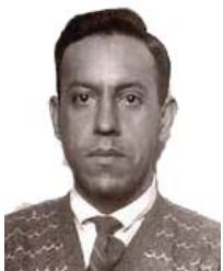
BLESSED MIGUEL PRO

After breakfast, we make a special visit to Holy Family Church and the shrine of the Mexican martyr Blessed Miguel Pro. We will visit the site of Fr Pro's assassination where we learn about the people who gave their lives for our faith in this area many years ago. From there, we visit the Cathedral at the Zocalo. This is one of the most beautiful and impressive squares in the Americas and is located in the center of Mexico City. We will make a brief visit to the National Palace, the seat of the Mexican Government and home to the enormous mural by world-renown artist Diego Riviera which depicts the origins of Mexico and its struggles for independence. This afternoon, we get an impression of the old Mexico City (Tenochtitlan) as we visit the last remaining canals at Xochimilco. Here the farms still produce flowers, fruits and vegetables for the city. We will take a leisurely trip in a festive gondola along the canal while enjoying a boxed lunch and may even hear some entertaining mariachi music! We return to the hotel for a farewell dinner and overnight. [B,L,D]