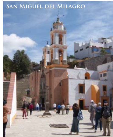
SAN MIGUEL DEL MILAGRO

waters associated with the miracle there. We have a group lunch at a local restaurant . Then, we explore the culture and local activities celebrating the Day of the Dead . This evening you have the opportunity to join friends for the culinary treasure of Mexico at the restaurant of your choice as dinner is on your own . Overnight in Tlaxcala. [B,L]