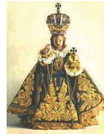
INFANT OF PRAGUE

First, we visit the Church of Our Lady Victorious in downtown Prague. Here we view the statue of the Infant of Prague, and also have an opportunity to visit the religious articles shop near the shrine. This non-profit extension of the Shrine's mission funds the restoration of Catholic churches in the Czech Republic. From there, we visit the Prague Castle area , which includes: the Old Royal Palace; Daliborka Tower; George Basilica; Rosenberg Palace; and St. Vitus Cathedral , the largest church in the country. The Cathedral is also home to the relics of St. Wenceslas, the country's first saint. Then, we visit Old Town , in the heart of Prague. This pedestrian friendly area is the perfect place to take in beautiful medieval architecture, relax at an outdoor café or visit sites such as St. Nicholas Church and the Town Hall. We will have the opportunity to explore independently. Sample Prague favorites at the restaurant of your choice as dinner is on your own . Overnight in Prague. [B]