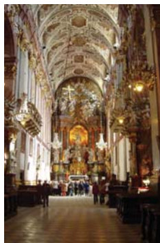
▲ OUR LADY OF CZESTOCHOWA

We bid farewell to Krakow and travel to Czestochowa . Upon our arrival, we will visit the Shrine of Our Lady of Czestochowa , one of the most important pilgrimage sites in all of Poland and home to the 600-year old Jasna Gora Monastery. St. Faustina, St. Maximilian Kolbe, and Pope John Paul II came to Czestochowa to offer their lives to God in holy service. Poland's holiest icon, a painting of Our Lady of Czestochowa (frequently called the Black Madonna), is enshrined here. The Black Madonna was brought to this site from Jerusalem in 1384. At certain times of the day a trumpet sounds and Our Lady is revealed to her faithful and loving children. The portrait has been the subject of numerous miracles and was one of Pope John Paul II's favorite Marian devotions. Today's final destination is Warsaw, where we visit St. Stanislaw Kostka Church (the church of Blessed Fr. Jerzy Popieluszko) and museum . Fr. Jerzy Popieluszko, a popular young parish priest, spoke out against the abuses of communism and supported the then-banned Solidarity labor union. Thousands flocked to hear his Sunday sermons. He was abducted by the Polish secret police on October 19, 1984, and his savagely beaten body was found eleven days later in an icy reservoir. Father Popieluszko's death serves as testimony to the struggle for freedom, basic rights, and human dignity. We proceed to our hotel to check in for dinner and overnight. [B,D]