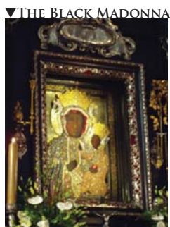
▼ THE BLACK MADONNA