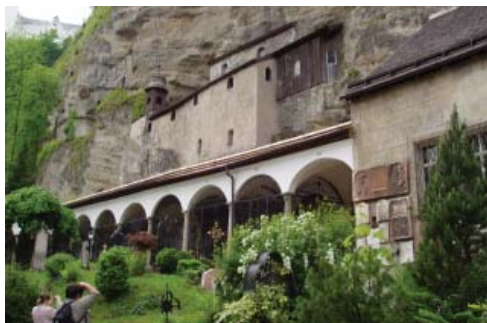
ST. PETER'S CHURCHYARD, SALZBURG

Salzburg, Austria, the birthplace to musician Amadeus Mozart and the setting for the famous musical "Sound of Music" is where we spend today. A local guide will board our motor coach this morning and take us through Salzburg on a "Sound of Music" tour. We begin at St. Peter's Churchyard and visit other sites associated with the musical, such as the Salzburg Cathedral, a view of Nonnberg Convent of Benedictine nuns, and the Fortress Hohensalzburg. We see the great houses, mansions, Festival Hall, and the Mirabelle Gardens. Later this afternoon, we have time to explore other city sites on your own, find a quaint spot to sit back and enjoy the culture of Austria and its people, or shop for souvenirs. This evening, we attend the Mozart Dinner Concert , where you will hear the most popular compositions of Mozart by candlelight and the music will be played by Salzburg artists dressed in historic costumes. The evening includes a multiple-course dinner, prepared according to traditional recipes from the 17th and 18th centuries. Overnight in Salzburg. [B,D]