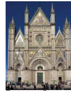
DUOMO OF ORVIETO