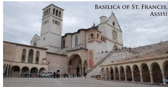
BASILICA OF ST. FRANCIS, ASSISI

the live white doves, thornless rose bush, and the cave where St Francis prayed in solitude. Then, we proceed to Grand Hotel Dei Congressi to check in for dinner and overnight. [B,D]