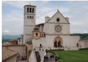
BASILICA OF ST. FRANCIS, ASSISI

Upon our arrival in Rome, we board our motor coach, and meet our full-time tour escort and proceed directly to Orvieto. In 1263 a pious German priest, Peter of Prague, stopped in neighboring Bolsena to celebrate Mass on his pilgrimage route to Rome. While a devout practicing-Catholic servant, Peter couldn't erase the skepticism he felt about Christ being present in the consecrated Host. As he uttered the words of Consecration at the altar above St. Christina's tomb, blood began seeping from the consecrated Host. Blood dribbled across his hands onto the altar and corporal leaving Fr. Peter quite stunned and confused. He interrupted Mass requesting to be taken immediately to Orvieto (just 10 miles away), where then Holy Father, Pope Urban IV, was residing. An investigation was launched and orders were given to retrieve and transport the Host and blood-stained linen to the Orvieto Cathedral where they were, and still are today, reverently enshrined and exhibited. It was this miracle that prompted Pope Urban IV to commission St. Thomas Aquinas to write a special Mass for what was to become our annual Feast of Corpus Christi. We visit the Cathedral of Orvieto (location of the shrine) where the Eucharistic Miracle is exhibited. We visit the Chapel of the Miracles and the Grotto of St. Christina . Our day concludes as we drive to Assisi to check in at the hotel for a welcome dinner and overnight. [D]