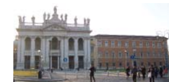
BASILICA OF ST. JOHN LATERAN, ROME

Upon the conclusion of the Canonization, we will remain in St. Peter's Square for the Papal Angelus before being transported back to the hotel for a group dinner. Some may opt to stay for a free afternoon in the area near the Vatican or may visit other venues. Those opting to tour on their own will be responsible for their own transportation to the hotel for dinner. Overnight in Rome. [B,D]