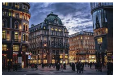
▲ VIENNA ▼ SCHOENBRUNN

The former residence of the imperial family, Schönbrunn Palace , is where we begin today. Then, after a tour, we enjoy a free day to sightsee independently , rest and relax, shop pray or soak in the sites, or prepare baggage for tomorrow's departure. This evening, enjoy authentic Austrian cuisine at the restaurant of your choice as dinner is on your own . Overnight in Vienna. [B]