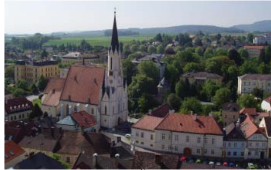
VIEWS OF SALZBURG

clude a multi-course dinner prepared to the traditional recipes from the 17th and 18th centuries. Overnight in Salzburg. [B,D]