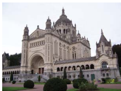
BASILICA IN LISIEUX

Most of today will be spent in Lisieux, home of St. Therese of the Child Jesus. She is the one whom Pope Pius X called "the greatest saint of modern times. We visit Les Buissonnets , the family home where Therese spent the early years of her life before entering the Carmelite Convent at the age of fifteen. We next visit the convent which houses the sacred relic of her body. From there, we spend time at the beautiful basilica and the gift shop . Next, we make our way to Paris where we enjoy a bus tour of the sites that make Paris so famous, including: The Eiffel Tour, Arc d'Triomphe, and the Champs-Élysées. We check in at our hotel for dinner and overnight. [B,D]