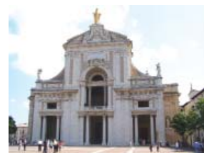
ST. MARY OF THE ANGELS

Our first stop today will be in the lower plains of Assisi, taking time to explore the Basilica of St. Mary of the Angels , built in 1569 to protect the Portiuncula. The Portiuncula is the church that St. Francis and his brothers were given shortly after Pope Innocent III approved of their rule. We also see the statue of St. Francis with the live white doves, the thornless rose bush and the cave where St. Francis prayed in solitude. From there, we proceed to Norcia to the piazza San Benedetto where we visit the 14th-century church of San Benedetto. Legends claim that the church was erected over the birthplace of Saint Benedict. We sightsee in Norcia and then return to Assisi. Dinner and overnight in Assisi. [B,D]