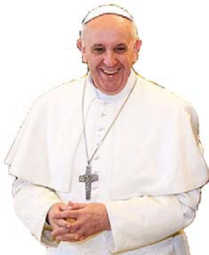
OUR HOLY FATHER, POPE FRANCIS

We attend the Papal Audience at St Peter's today (provided our Holy Father is home). We listen to the words of His Holiness Pope Francis and receive his blessing with pilgrims from all over the world. After the audience, we visit St. Praxedes to venerate the Column of Christ's Flagellation. Our next stop is the beautiful Basilica of St. Paul Outside the Walls which houses the remains of St. Paul under the main altar. We visit the Catacombs before we enjoy a farewell dinner at Ristorante de Benito . Overnight in Rome. [B,D]