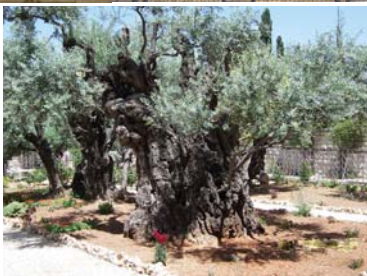
▲ GARDEN OF GETHSEMANE