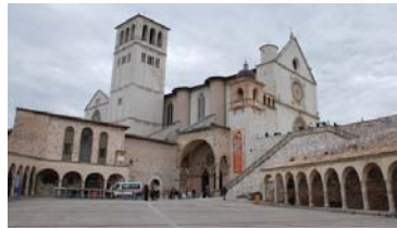
Basilica of St Francis

houses her incorrupt body in a crystal casket in the crypt. Off the main nave of the Basilica is the crucifix from which Christ spoke to St Francis in San Damiano. St Francis