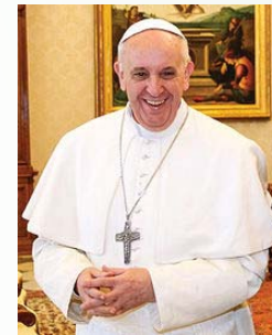
Our Holy Father, Pope Francis

• Spend time at the Spanish Steps and the streets nearby that are lined with upscale shopping.