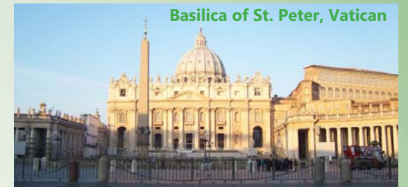
Basilica of St. Peter, Vatican

Restaurants are everywhere in Rome. This evening, enjoy dinner on your own at the location of your choice. Overnight in Rome. [B]