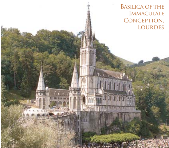
BASILICA OF THE IMMACULATE CONCEPTION, LOURDES

We gather at the hotel for a group farewell dinner. After dinner we again have the opportunity of participating in the Candlelight Procession . Overnight in Lourdes. [B,D]