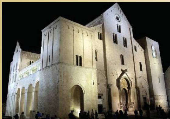
Basilica di San Nicola