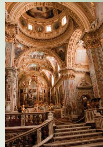
Inside the Basilica of the Abbey at Montecassino

This morning we depart Corato and make the journey northwest to Rome. En route, we stop in Cassino to visit the Abbey of Montecassino. In 529 AD, St Benedict founded the monastery which makes it one of Europe's oldest. The monastery was built and destroyed on four occasions between 577 and 1944. Today, the Abbey, a replica of the previous 17th-century structure, is a working monastery. From there, we continue to Rome to check in at the hotel for dinner. This evening, we enjoy a bus tour to see the city at night. Overnight in Rome. [B,D]