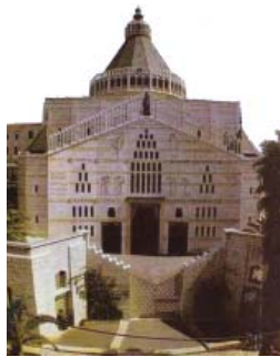
Church of the Annunciation

Upon our arrival in Tel Aviv, we board our motor coach and drive north to Caesarea Maritime where St. Paul was imprisoned, tried, and sent from this Mediterranean harbor to Rome. We visit one of Herod the Great's palaces and see the ruins of the ancient amphitheater next to the ocean. From there, we stop at the Stella Maris, Our Lady of Mount Carmel and the home of the prophet, Elijah. Today's journey concludes as we make our way into Tiberias to check in at our hotel for dinner and overnight.