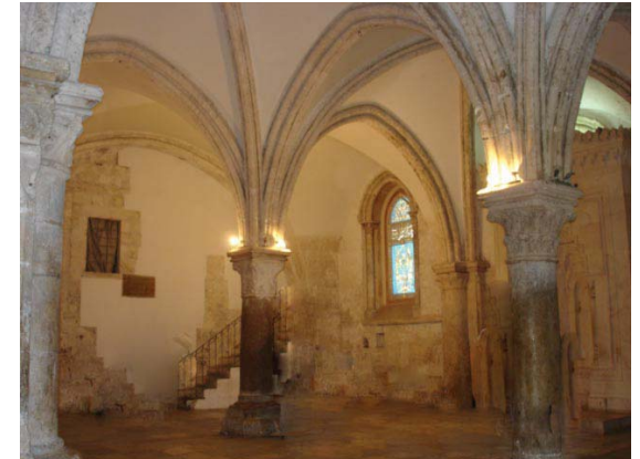
The Upper Room

Ein Karem, birthplace of John the Baptist and Church of the Visitation where Mary uttered the words of the Magnificat will be our first visit of the day. From there we proceed to Bethlehem to visit the Church of the Nativity, St. Catherine's, the Manger, the Crusader's Cloister and the Grotto of St. Jerome. We celebrate Mass (subject to confirmation) at the Church of Nativity. Then, we visit the cave in Shepherd's Field and view the Fields of Boaz. After shopping in Bethlehem, we visit Mount Zion, the Upper Room and Domitium Abbey. We continue to Bethany, home of Mary and Martha before returning to the hotel for dinner and overnight.