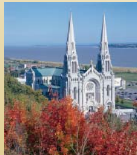
Sainte-Anne-de-Beaupré Basilica

Our group will spend time in Quebec City enjoying a scenic tour. We see the Place Royale, where in 1608 Samuel de Champlain came ashore and built the first French settlement in North America. We see the Citadelle, a military compound that is now on the National Historic Site registry and was designated a World Heritage Site in 1985. Then, we see the spectacular Chateau Frontenac hotel which crowns the city offering splendid views of the St. Lawrence River. The icon is located near the Citadelle. From there, we visit and celebrate Mass (subject to confirmation) at the oldest Catholic parish in North America, the magnificent Cathedral Notre Dame de Quebec in the historic district. The Cathedral is a rare and dramatic gem of Gothic Revival architecture mixed with an exceptional array of blues, azures, reds, purples, silver, and gold. The unique glass in the sanctuary is non-traditional as it is not inspired by biblical scenes but instead depicts the religious history of the city. We have the privilege of participating in the cathedral's 350th anniversary year. In celebration, the Holy Door at the Cathedral is open to pilgrims until December 28, 2014. We spend time at the cathedral and see the door. We conclude our day as we return to our hotel to enjoy dinner. Overnight in Quebec City. (B, D)