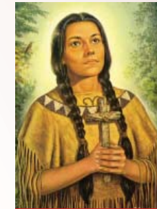
Saint Kateri Tekakwitha

Just 17 miles southwest of Montreal is Kahnawake, home of the final resting place of St. Kateri Tekakwitha, Canada's first aboriginal person to be sainted. Kateri's life, although short, was ear-marked for holiness. Born to a pagan Iroquois father and an Algonquin Christian mother in what would then have been upstate New York, the Mohawk woman (known as "Lily of the Mohawks") was unwavering in her faith despite being ostracized by her native peers. Kateri, the lone survivor from a family devastated by smallpox, lived