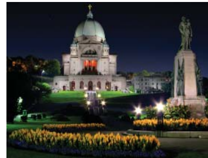
Saint Joseph's Oratory of Mount Royal

perched on the slopes of Mount Royale and capped with an enormous copper dome built to honor the patron saint of Canada, St. Joseph. The oratory is a major draw for North American pilgrims in search of healing. Before the Oratory was built, Brother Andre Bessette, a sickly lay brother devoted to St. Joseph, was given the task to visit ill students. Through his intense and constant prayer to St. Joseph, it didn't take long before Brother Andre became known as the miraculous healer. As his healing ministry blossomed so too did incoming donations. In 1904 he used the money to build a small 15 x 18 foot timber holy house. Hundreds of healings were reported. It was after Brother Andre's death that his dream of a beautiful shrine to St. Joseph came to fruition in the mid-1900s. He is entombed in the basilica. He was beatified in 1982 and then canonized a saint by Pope Benedict XVI in 2010. We will enjoy free time to soak in the beauty of this very holy place and spend time in prayer. There will also be an opportunity to reconcile with the Lord through the sacrament of confession. We return to our hotel for dinner and overnight. (B, D)