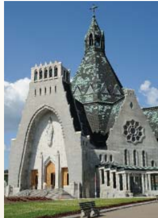
Basilique Notre-Dame du Cap

Our first stop today will be a visit to and Mass at St. Joseph's Oratory (subject to confirmation), a basilica