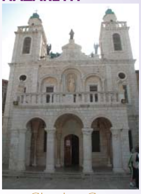
Church at Cana