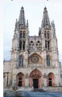
CATHEDRAL IN BURGOS

This morning we visit the Cathedral in Burgos, one of the finest examples of Gothic architecture in Europe. Then, we depart Burgos and travel to Loyola where we visit the birthplace of St. Ignatius, founder of the Society of Jesus (Jesuits). There, we will see the magnificent 17th-century basilica dedicated to him. Behind the sanctuary is the Santa Casa, the three storied 14th-century family home of the saint. Pilgrims are invited to tour the rooms and to visit the chamber where St. Ignatius was born. The most venerated place in this building is the room