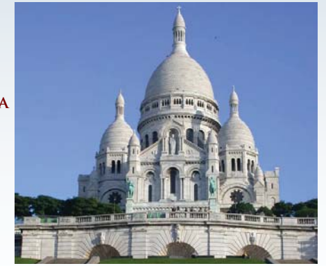
▶ BASILICA OF SACRE-COEUR

Our Lady appeared to St. Catherine Laboure in 1830. There we see the incorrupt body of St. Catherine and the waxed body of St. Louise de Marillac who, with the help of St. Vincent de Paul, established the Daughters of Charity. We celebrate Holy Mass there (subject to confirmation) and then proceed to the chapel in the motherhouse of the Congregation of the Mission which houses the incorrupt body of St. Vincent de Paul. Next, we visit Cathedral of Notre Dame which is the most famous Gothic Cathedral in the world devoted to the Blessed Mother. The cathedral is more than 700 years old and took 87 years to complete from the laying of the cornerstone in 1163 to the completion of the Western facade and northern rose window in 1250. It is best characterized by ogee archways, ribbed vaults, flying buttresses, rose stained glass windows, ornately crafted spires, and gargoyles, which were the guardians of grand cathedrals. From there, we ascend to the top of Montmartre hill to visit the world famous Basilica of Sacre-Coeur. In the Basilica, above the high altar, there is a monstrance containing the Consecrated Host. Our journey concludes as we check in at our hotel for dinner and overnight.