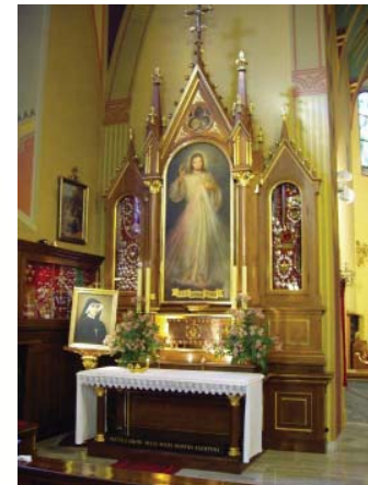
Divine Mercy Shrine