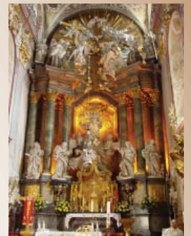
Inside church Czestochowa