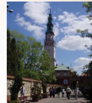
Outside church Czestochowa High altar

the altar in the sanctuary, right under the miraculous image of the Merciful Jesus. We enjoy a guided tour of the grounds by a Divine Mercy sister. From there, we proceed to St. Mary's Church and St. Florian's, which was Karol Wojtyla's second priestly assignment. Our day concludes as we return to our hotel in Krakow for dinner and overnight.