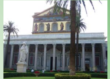
St. Paul Outside the Walls

Our first stop today will be St. Paul Outside the Walls, a beautiful basilica which houses the remains of St. Paul under the main altar. We continue on the Old Appian Way to the Catacombs. Then, we proceed to St. Peter's Basilica for a guided tour. The Basilica is very impressive with its imposing architecture, rich ornamentation, and marvelous works of art. We view one of Rome's most recognized works of art, Michelangelo's Pieta. Then, we explore the Vatican Museum and Gallery, and the Sistine Chapel. The remainder of the day is free to explore on your own. Suggestions include: