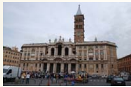
St. Mary Major