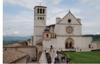
Basilica of St. Francis, Assisi

An early start will help us as we explore the city of Assisi. We are escorted by cars to the church of St Damiano. After we spend a little time there we visit the Basilica of St Clare, which houses her incorrupt body in a crystal casket in the crypt. Off the main nave of the Basilica is the crucifix from which Christ spoke to St Francis in San Damiano. St Francis heard a voice say, "Go Francis, repair my church, which is in ruin." Thinking that God was telling him to rebuild San Damiano, Francis renounced worldly goods and began immediately to repair the building. Only later did the saint realize that God had been speaking of His living Church. Next, we visit one of Christianity's most revered shrines, the Basilica of St Francis, and see the frescoes depicting events in the life of this gentle saint. We celebrate Holy Mass there (subject to confirmation). After Mass, there will be some free time to explore the city on your own. Suggestions include: