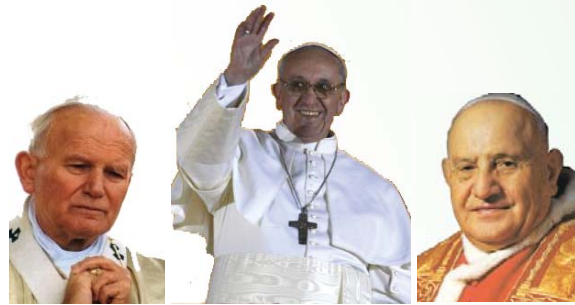
Pope John Paul II 1978-2005

the street we the Sancta Scalia - Holy Stairs, which were transported from Pilate's palace in Jerusalem and on which the Savior climbed before His crucifixion. At the top is the Sancta Sanctorum, the 14th-century reliquary chapel of Pope Boniface VII. Those who wish to pray each step on their knees may do so. The option to take the side stairs on foot is also available. Then, we stop at the Basilica of St Mary Major, a beautiful Marian church. Inside the Basilica we view relics of Jesus' manger from Bethlehem. From there, we visit St. Alphonsus which is located close to the Basilica of St. Mary Major. The church was built and named in honor of the founder of the Redemptorist Congregation, St. Alphonsus Liguori, but was dedicated to the Most Redeemer. The church contains the original Picture of Our Lady of Perpetual Help. We have the opportunity to venerate this Holy icon. This evening, join friends or enjoy a private sampling of authentic Italian cuisine at the trattoria (local diner) or restaurant of your choice as dinner is on your own . Overnight in Rome. [B]