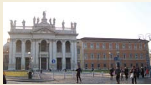
St. John Lateran

Then we gather on the motor coach for our return to Rome. We check in at our hotel for dinner and overnight. [B, D]