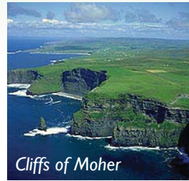
Cliffs of Moher

Upon our arrival in Shannon, we meet the driver of our private motor coach and our full-time tour escort. We proceed to the Cliffs of Moher, one of Ireland's most stunning natural beauty locations which defiantly stand as giant natural ramparts against the aggressive might of the Atlantic Ocean. In some places the cliffs rise over 700 feet