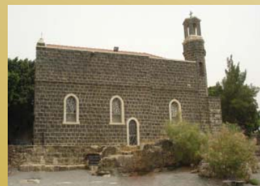
Church of St. Peter's Primacy

The Mount of Beatitudes will be our first stop today. We spend time in contemplative reflection and prayer before continuing to Capernaum, the town where Peter lived and within which Jesus made his base of operations for His Galilean ministry. As we visit the ruins of the town you will find out why Jesus focused his ministry here, where ancient Judaism flourished. We will visit the Synagogue where Jesus healed and taught, and also