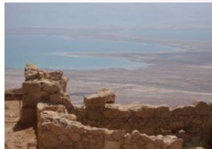
View of Dead Sea from Masada

Ein Karem, birthplace of John the Baptist and Church of the Visitation where Mary uttered the words of the Magnificat will be our first visit of the day. From there we proceed to Bethlehem to visit the Church of the Nativity, St. Catherine's, the Manger, the Crusader's Cloister and the Grotto of St. Jerome. We celebrate Mass (subject to confirmation) at the Church of Nativity. Then, we visit the cave in Shepherd's Field and view the Fields of Boaz. After shopping in Bethlehem, we visit Mount Zion, the Upper Room and Dormition Abbey. We continue to Bethany, home of Mary and Martha before returning to the hotel for dinner and overnight.