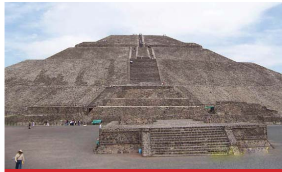
San Juan Teotihuacan ~ Pyramid of the Sun