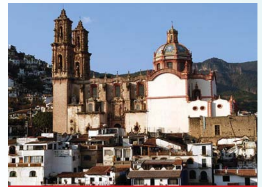
Taxco ~ Santa Prisca