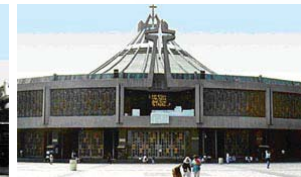
▲ New Basilica