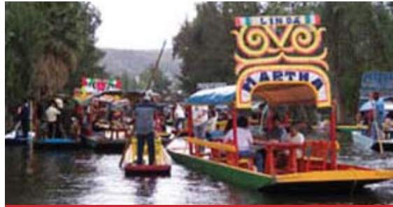
Xochimilco ~ Gondola

representing the mix of the Aztec, European and modern influences that have shaped this city. From there we have an introductory tour at the beautiful Basilica and Shrine of Our Lady of Guadalupe in preparation for our extended visit there on Saturday. Today we will celebrate Mass at the Basilica (subject to confirmation) before continuing our journey. This afternoon, we get an impression of the old Mexico City (Tenochtitlan) as we visit the last remaining canals at Xochimilco. Here the farms still produce flowers, fruits and vegetables for the city. We will take a leisurely trip in a festive gondola along the canal while enjoying a special box lunch and may even hear some entertaining mariachi music! We return to our hotel and the remainder of the afternoon and evening are free for you to experience your choice of the culinary treasures of Mexico as dinner is on your own . Overnight in Mexico City.