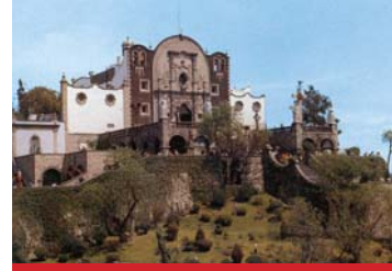
Our Lady of Guadalupe ▶