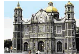
Old Basilica ▲