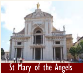
St Mary of the Angels

Upon our morning arrival in Rome, we board our motor coach and travel to Assisi, a tranquil town tucked into the Tuscan hillside. We stop first in the lower plains to visit the Basilica of St. Mary of the Angels, which was built in 1569 to protect the Porziuncola (the church St. Francis restored in 1205 and the birthplace of the Franciscans). We also see the statue of St. Francis, the live white doves, the thornless rose bushes and the cave where St. Francis prayed in solitude. Mass will be celebrated in the Portiuncula (subject to confirmation). Then, we complete the journey to our hotel in Assisi, where we check in. You will have time to wander through the streets enjoying the scenery and browsing through shops. Dinner and overnight in Assisi.